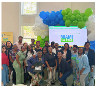
Thank You Luncheon for VITA volunteers!