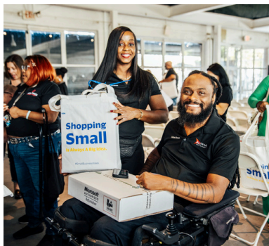
Branches' Micro-Business participants receiving laptops at the Empower Your Business: A SCORE and Visa Small Business Resource Summit.