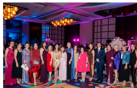
Branches 2025 Black Tie & Blue Jeans Gala Committee

The Gala supported critical services that Branches provides to over 10,000 individuals. These programs include daily after-school enrichment, tutoring, college and career preparation for more than 550 students, along with financial coaching, micro-business support, free tax preparation, and emergency assistance for thousands of adults. More than 600 guests attended the sold-out event, including local philanthropists, business leaders, and community partners raising a record-breaking $862,000 to fuel Branches' mission.