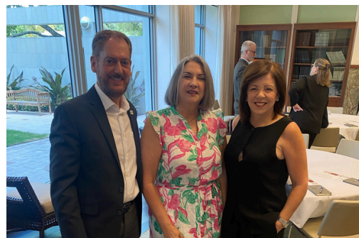
BankOn Miami Planning Meeting and Lunch.