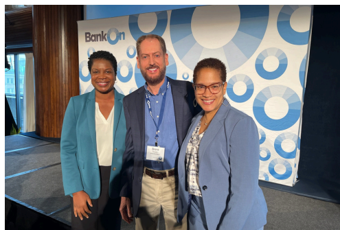
Branches' President & CEO at the 2025 Bank On National Conference in Washington D.C.