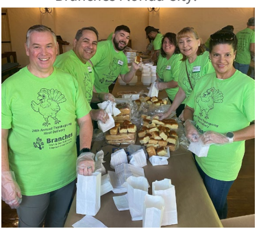
Volunteers at First UMC Coral Gables packing meals.