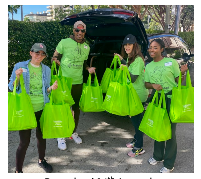
Branches' 24th Annual Thanksgiving Meal Delivery!