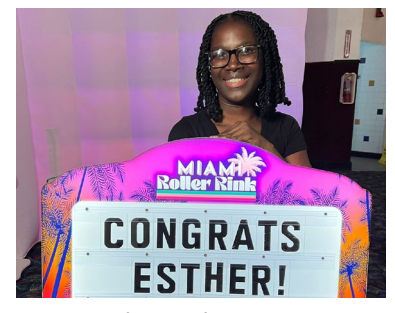
Branches student gets into Yale University!