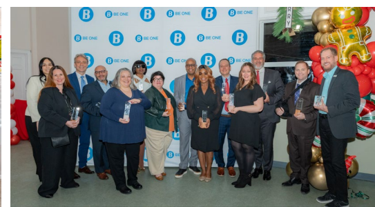
Branches' Micro-Business Holiday Party. Bridge Builder 1