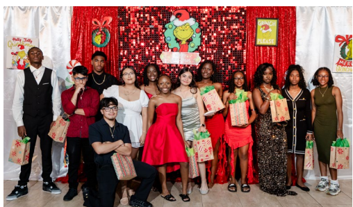
Branches Florida City Senior Class celebrating their annual Branches Ball.