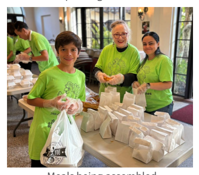
Meals being assembled at Coral Gables Congregational.