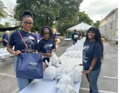
Meals being assembled at Branches Lakeview.