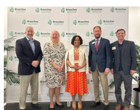
Celebrating EITC Awareness Day with the IRS and United Way Miami at the Main Library.