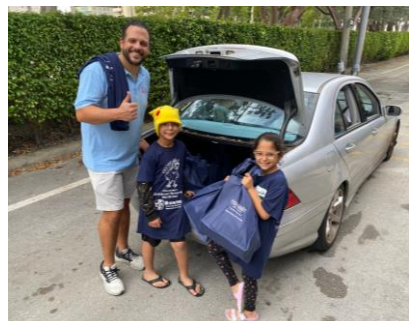
Volunteer drivers get loaded up with meals and are off to deliver!