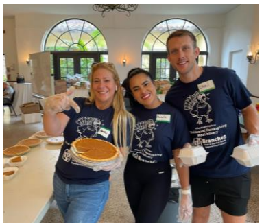
Volunteers slicing pies at Coral Gables Congregational United Church of Christ.