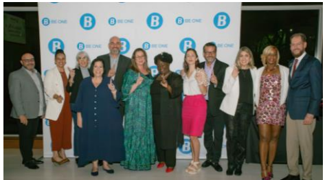
Micro-Business participants at the Be One Holiday Party.