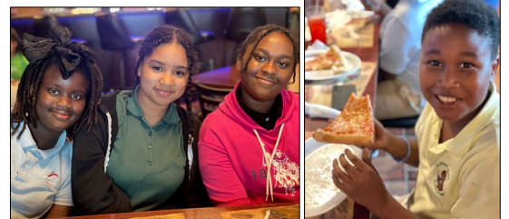
Our 5 th Graders enjoying their Graduation Pizza Party hosted by Mamma Mia 2 in Homestead!