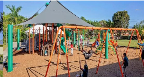
The new playground, eagerly awaited by the Florida City students, was constructed in May of 2015. The Shade System was added in early 2018

Branches, formerly Miami Urban Ministries, was established in 1973 as the urban and social justice agency of what is now the South East District of the United Methodist Church. Up until 1999, Branches focused on grassroots organizing, advocacy and working with community members who were disadvantaged and/or experiencing social injustice. During this time, Branches focused resources in the areas of social crisis, immigration, housing, hospice care and hurricane relief, among others.