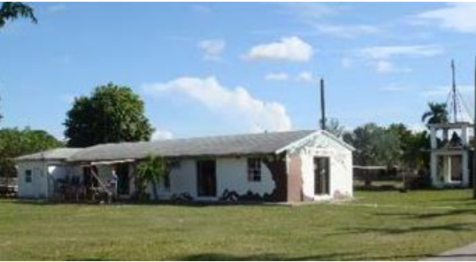
Branches Florida City, circa 2000