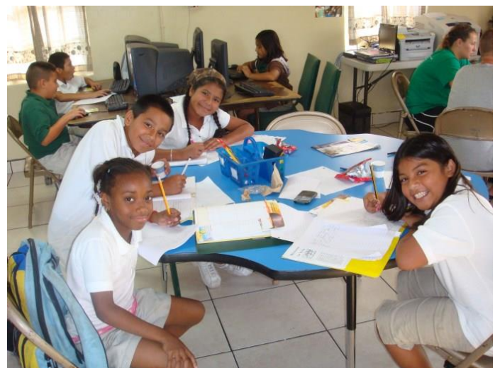
Students completing their homework, circa 2009

To learn more about Branches' History, please visit branchesfl.org/50th-anniversary