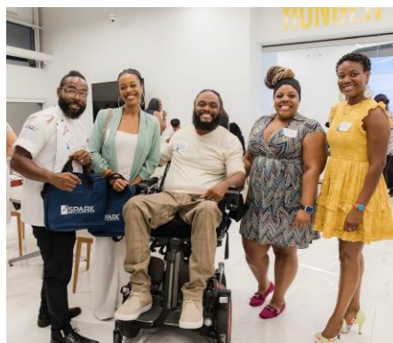
Branches' SPARK Micro-Business entrepreneurs mix and mingle at the reception.