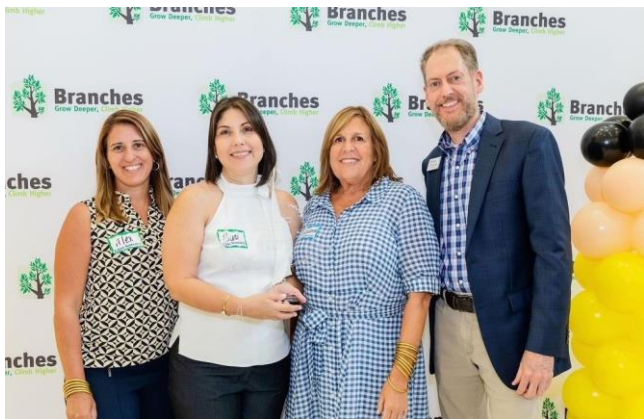
Palmer Trinity School was honored with the 2022 Herbert C. Parlato Volunteer Award for their incredible support of Branches!