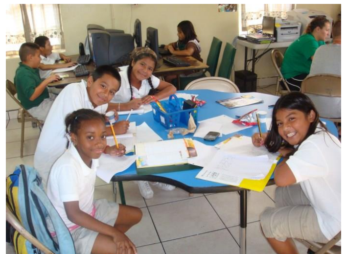
Students completing their homework, circa 2009

Today in 2022, Branches serves over 15,000 individuals per year, in particular 450+ students and their families every day at all 3 of its locations. Thanks to its many partners, Branches is able to provide truly life-changing opportunities to hardworking families and their children to help break the cycle of intergenerational poverty. Here's to many more years of changing lives!