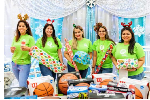
Branches' Under the Tree Toy Shops!

Several years ago, Branches began focusing on how we could better serve our parents over the holidays. Instead of just handing out toys to our kids, we launched the Branches Under the Tree Toy Shops which allow our families to select and purchase a toy of their choice. All toys are sold at around 90% off. This instills pride in our families as they are able to personally give their own gifts to their own children on Christmas morning. A special thank you to FPL for your generous support!