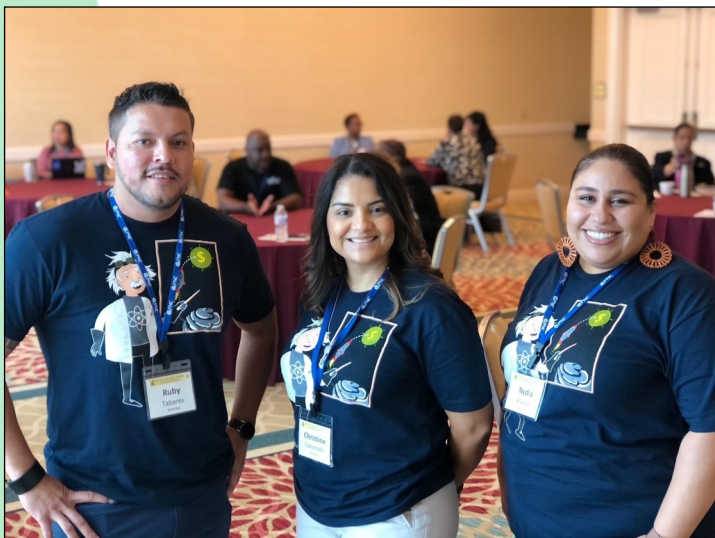
Branches' Financial Coaches facilitating discussions during the 2021 Florida Prosperity Partnership Conference, where Branches was also a featured presenter.