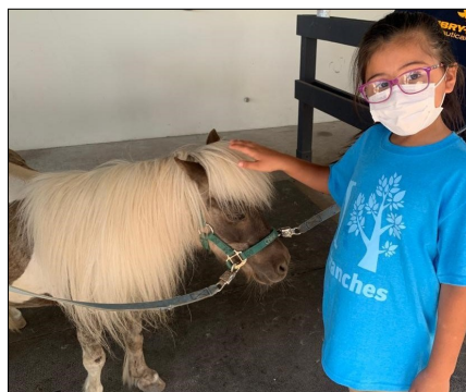
Reading and learning about horses through our new Literacy Program at Whispering Manes!