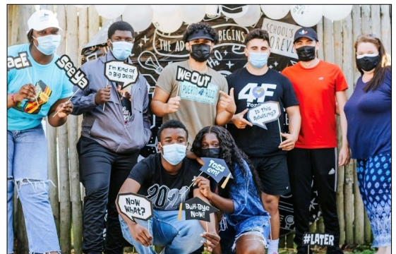
Celebrating our 17 High School Seniors with a party, gifts and waffle bar at the Everglades Alligator Farm.