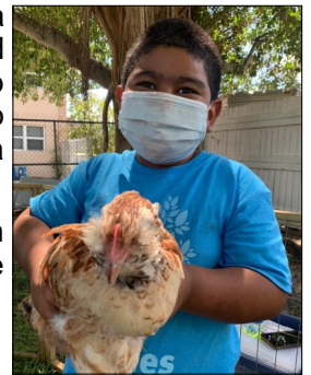
Branches hosted Spring Break Camp for all our students and brought fun visitors on-site!