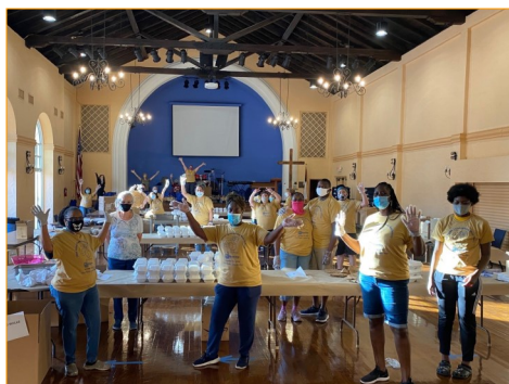
Volunteers working hard at First United Methodist Church of Coral Gables.