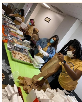
Let the meal packaging begin!