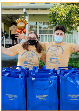
All smiles, even masked, on Thanksgiving morning.