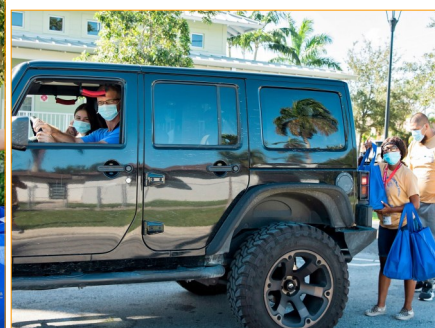
Volunteers get loaded up with meals and head out to deliver!