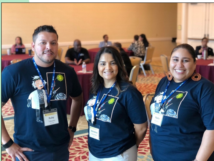
Branches' Financial Coaches facilitating discussions during the 2021 Florida Prosperity Partnership Conference, where Branches was also a featured presenter.