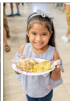
A young Branches student enjoying a yummy meal.