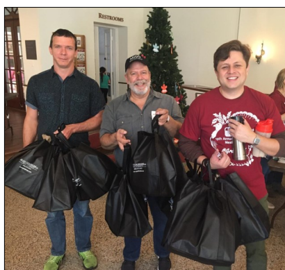
Volunteers head out to deliver hot meals to families in need.