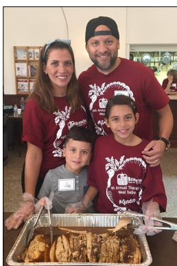
A family who volunteers together, spreads joy together!