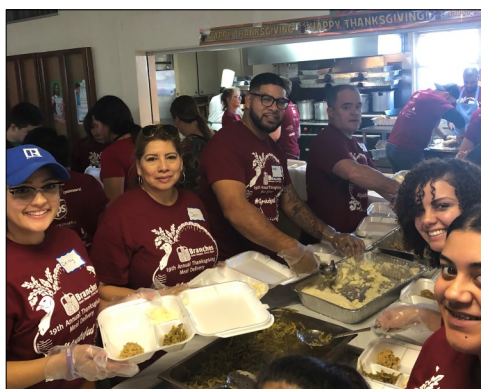
UPS and other volunteers are busy serving up delicious hot meals.