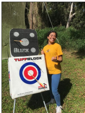
Archery is a favorite activity!

This special camp is truly a place for growth, love, experiencing God and for branching out in ways our students never thought they could, and it is an experience that will impact our Branches campers forever.