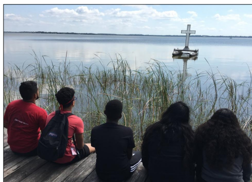
Quiet reflection time on the Lake is a true blessing and enjoyed by all.