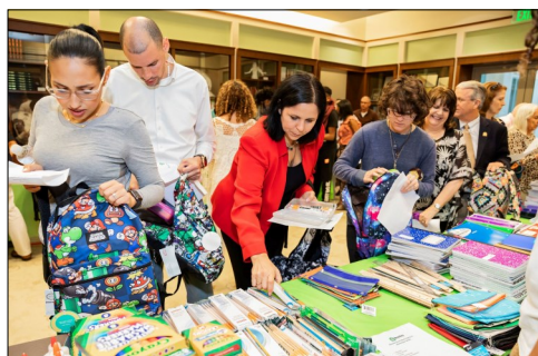
Volunteers are busy stuffing backpacks for Branches'