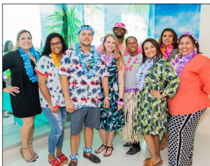
Branches staff strike a pose at the volunteer thank you reception.

Branches is proud to lead Miami Tax Pros and to once again have served as the Miami-Dade County lead agency for the Volunteer Income Tax Assistance (VITA) Program which offers help to people in our community that need assistance navigating the tax preparation system, are low income or have special needs. Our volunteers and staff also help filers check if they qualify for special tax credits such as the Earned Income Tax Credit (EITC) among others. About 60% of individuals living in Miami-Dade qualify for VITA, yet less than 2% are taking advantage of it.