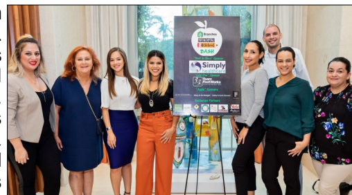
The Simply Healthcare Team is all smiles!

We are also grateful for the wonderful support of all our school supply drive partners who helped us make sure all 441 of our Branches' children and youth went back to school ready to learn. A special thank you also goes out to the following donors who went above and beyond: Alma Advertising Agency, BB Americas, Carnival Cruise Lines and the Templeton Family. Here's to an awesome school year!