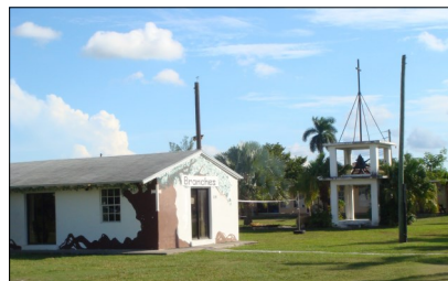
Branches Florida City circa 2009.