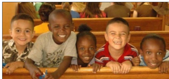
Branches FL City kiddos circa 2005. One is a high school senior and the others are in college today!