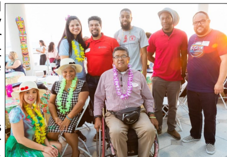
VITA Volunteers are all smiles at the Luau Celebration Dinner.

To celebrate the 400+ volunteers who helped make VITA possible, Branches hosted a special thank you reception at the University of Miami's Lennar Foundation Medical Center rooftop on Friday, May 17th to show our sincere appreciation for their hard work. Together, these amazing volunteers served a total of 13,120 hours helping individuals prepare taxes free of charge. Thank you again to everyone involved in this incredible and truly worthwhile community effort!