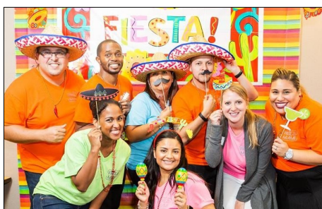
Branches staff strike a pose at the thank you reception.

Branches is proud to once again have served as the Miami-Dade County lead agency for the Volunteer Income Tax Assistance (VITA) Program which offers free tax help to people who earn approximately $54,000 annually or less and need assistance in preparing their own tax returns. Our volunteers and staff also help filers check if they qualify for special tax credits such as the Earned Income Tax Credit (EITC) among others. About 60% of individuals living in Miami-Dade qualify for VITA, yet less than 2% are taking advantage of it.