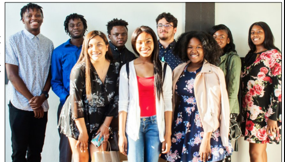
Branches' youth want a mentor! Are you in?