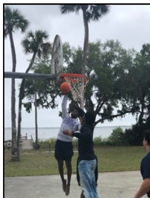
Basketball is a favorite!