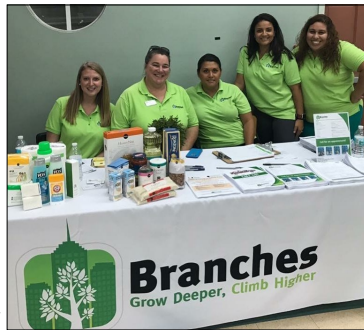
The Branches team at Centro Campesino serving the community.