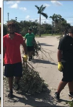
Branches students help clean up post-storm and sort care packages for families.