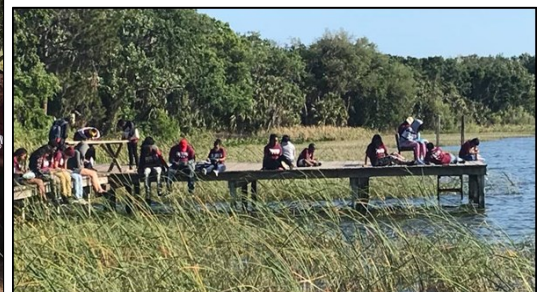
Quiet reflection time on the Lake is a true blessing and enjoyed by all.