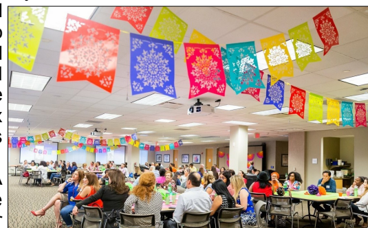
VITA Volunteers enjoy a delicious Mexican Feast at the VITA Fiesta.

To celebrate the 400+ volunteers who helped make VITA possible, Branches hosted a special thank you reception at Florida Blue in Doral on Friday, May 4th to show our sincere appreciation for their hard work. Together, these amazing volunteers served a total of 13,120 hours helping individuals prepare taxes free of charge. Thank you again to everyone involved in this incredible and truly worthwhile community effort!