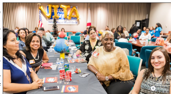
VITA Volunteers are all smiles at the Thank You Reception!

To celebrate the 460+ volunteers who helped make VITA possible, Branches hosted a special thank you reception at United Way on Thursday, May 25th to show our sincere appreciation for their hard work. Together, these amazing volunteers served a total of 15,089 hours helping individuals prepare their taxes free of charge. Thank you again to everyone involved in this incredible community effort!