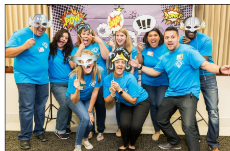
Branches staff strike a pose at the thank you reception.