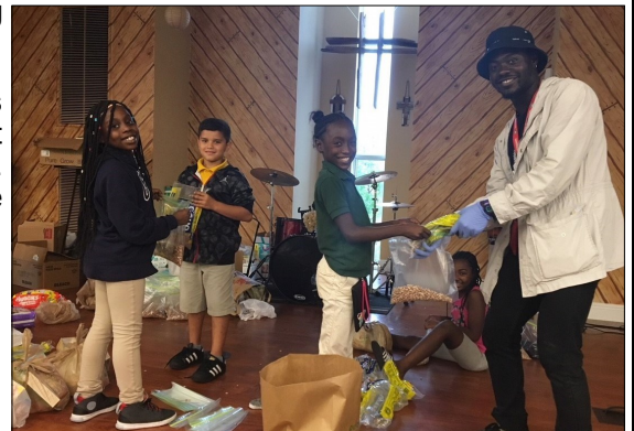
Branches students helping to prepare Post-Hurricane Irma food and baby care relief packages.