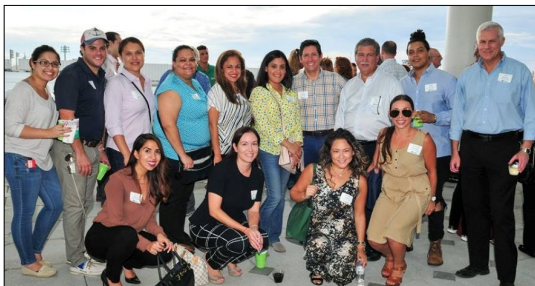
Plaza Construction came out in full force!