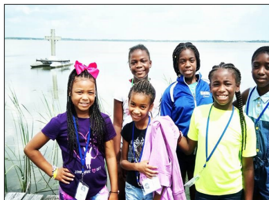
Middle School girls enjoying some free time together.