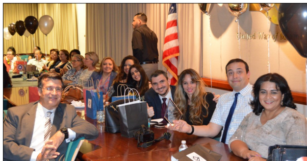
VITA Volunteers are all smiles at the thank you reception!

To celebrate the 430+ volunteers who helped make VITA possible, Branches hosted a special thank you reception at United Way on Friday, May 20th to show our sincere appreciation for their hard work. Together, these amazing volunteers served a total of 10,020 hours helping individuals prepare their taxes free of charge. Thank you again to everyone involved in this incredible community effort!