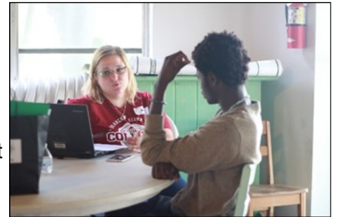
High school senior meets with a college counselor to plan for the future.

On August 12 and 13, Branches Climb to College & Career held an overnight boot camp at the University of Miami to help 33 rising junior and seniors jump start the college planning process. The students had the opportunity to explore the college campus, learn tips to prepare for college entrance exams and plan ways to pay for college through Financial Aid 101. During the boot camp, students also met one-on-one with a professional college counselor to create a plan for the application process and build a list of best fit colleges. In addition, students worked with writing coaches to draft their personal statements. The boot camp ended with a banquet where the students dressed up to celebrate each other.