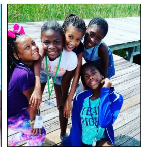
All smiles at Warren Willis Camp!