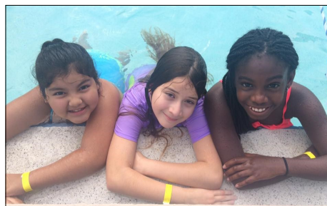
Pool time is a favorite camp activity!