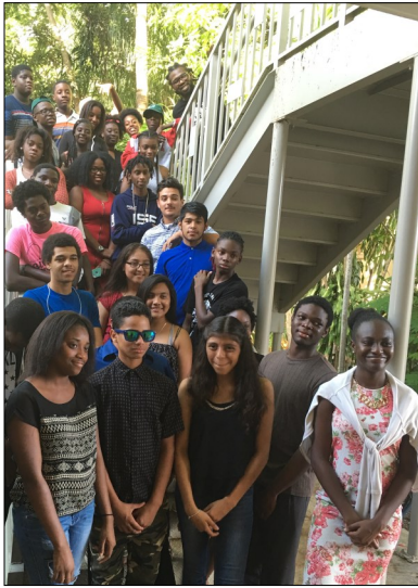
Proud Branches students are all smiles as they prepare for the banquet.

Summer is a popular time when most high school juniors and seniors visit colleges and start planning for their future as they anticipate the start of a new school year. However, that is not always the case for all students. The reality is that many low income students face college planning challenges due to social and language obstacles, less access to information and guidance, less exploration because of low expectations and underestimation of the amount of financial help available.