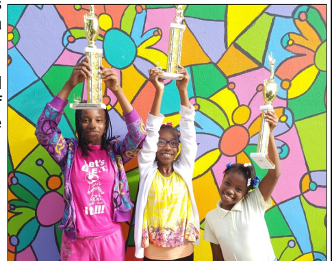
Students at Branches Lakeview succeeding in school and receiving awards for their local Spelling Bee competition.