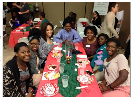
Holiday Dinner this past December with Branches' High Schoolers and returning College students.