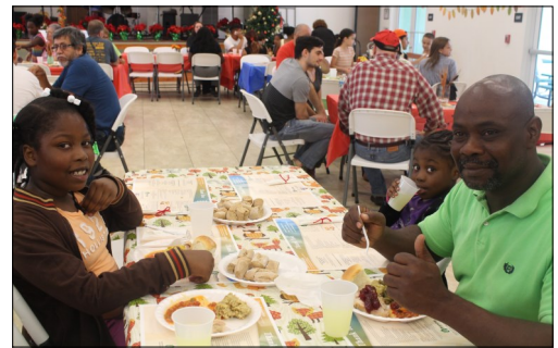
A Branches family enjoying their meal!