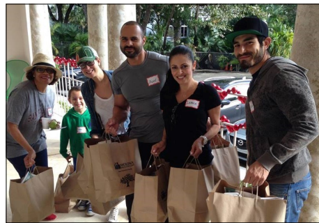
Volunteer drivers off to make deliveries.