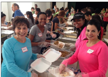
Volunteers serving up deliciousness.