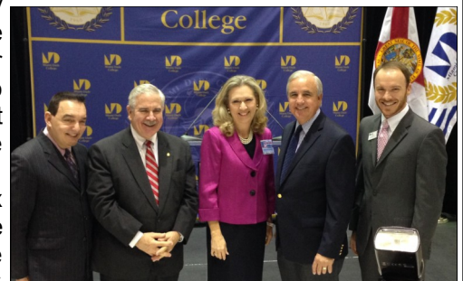
VITA kick-off at Miami-Dade College.