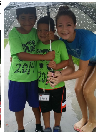
Summer Shade Cuteness!