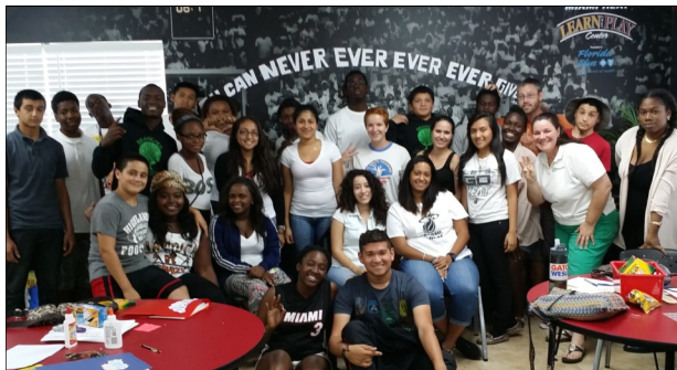
Branches hires and trains a select group of its youth to serve as Summer Guides for our Summer Shade camp each year. 25 proud Guides pictured above!