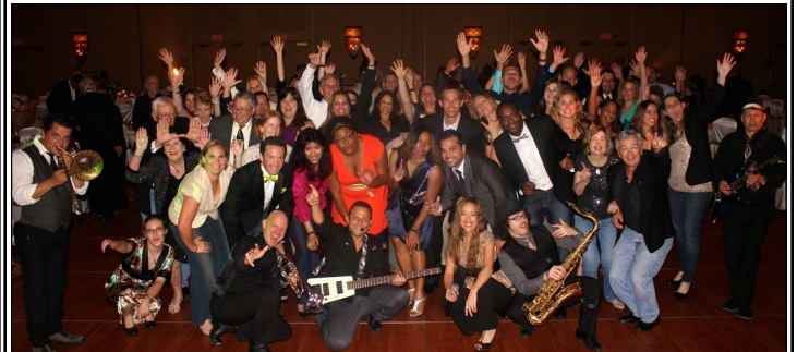
Fun and Fellowship at Black Tie & Blue Jeans!!