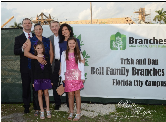
Above: The Bell Family proudly unveils the name of the new Branches Florida City building.

To make a gift, please contact Isabelle Pike at 305-442-8306 x1002 or ipike@branchesfl.org