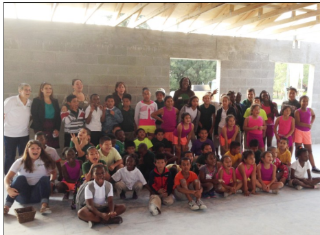
Right: The Branches students are overjoyed about their first tour of their new home.