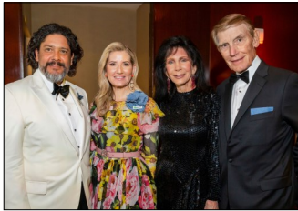
The benefit dinner brings together hundreds of caring supporters!

The Annual Black Tie & Blue Jeans Benefit event is our signature fundraiser. Volunteers may help secure sponsorships and auction items, and be part of the different teams of auction set up & tear down, auction check-out, greeters, runners and more.