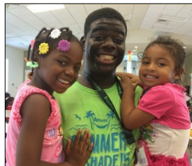
Summer Shade Camp provides fun and learning!