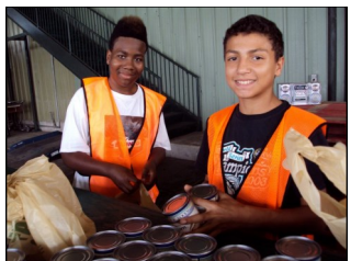
Students learn the importance of volunteering and giving back.

Volunteers have the chance to be involved in our 7 week Summer Shade Camp. The purpose of Summer Shade is to help to prevent summer learning loss and provide a safe and fun environment.