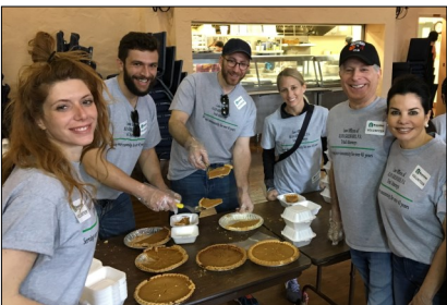
Last year, over 700 volunteers helped package and deliver over 4,500 meals!

On Thanksgiving morning, volunteers are needed to help assemble, package and/or deliver hot meals to families in need. All meals are delivered and include a large tri-lingual informational pamphlet about vital services and resources.